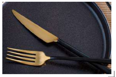
PVD | Bicolor