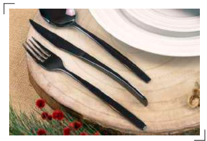
PVD | Black