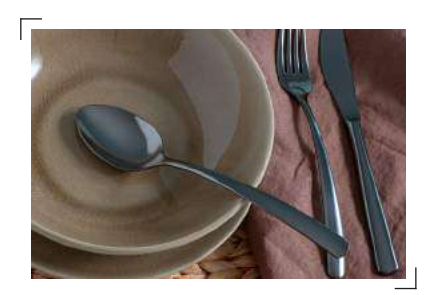
PVD | Antracite