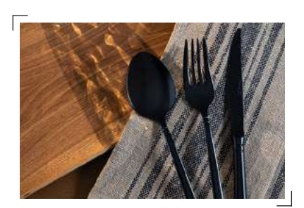
PVD | Blue