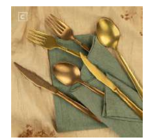
Inspire-se em | Get inspired by | Inspírate en | Laissez-vous inspirer par @cristema_cutlery